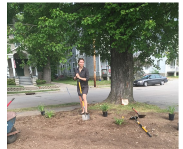
City staff and community volunteers plant flowers in Middle Village

of the City’s housing rehabilitation programs. Since 2011, total investment of time, effort, and money by all neighborhood stakeholders is estimated to be nearly $5 million!